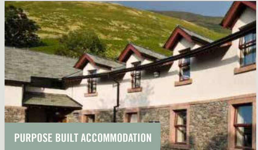
PURPOSE BUILT ACCOMMODATION