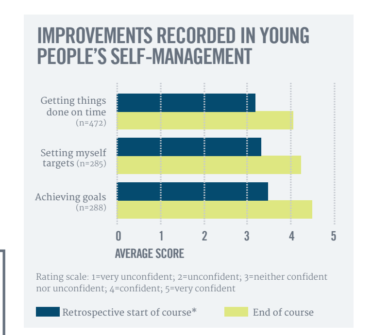
Full results can be found in Additional Research, page 65, Figures 17-18.