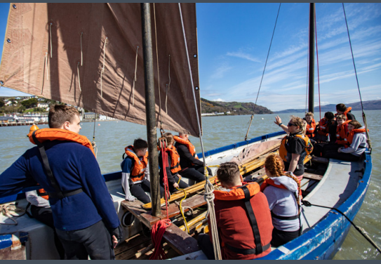
Sailing in the estury